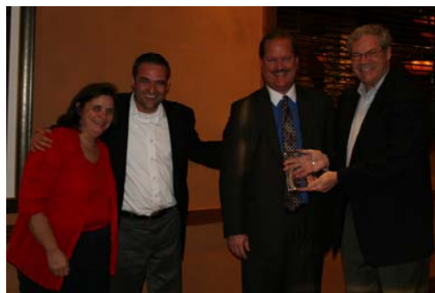
Outstanding Sponsor of the Year Anders Health Care Services